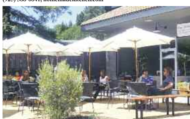
The patio at Home/Made Kitchen Café and Bakery.

Home/Made Kitchen Café and Bakery 337 Rheem Blvd., Moraga (925) 388-0841, homemadekitchen.com